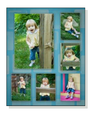
Dream Mat 16x20—$238